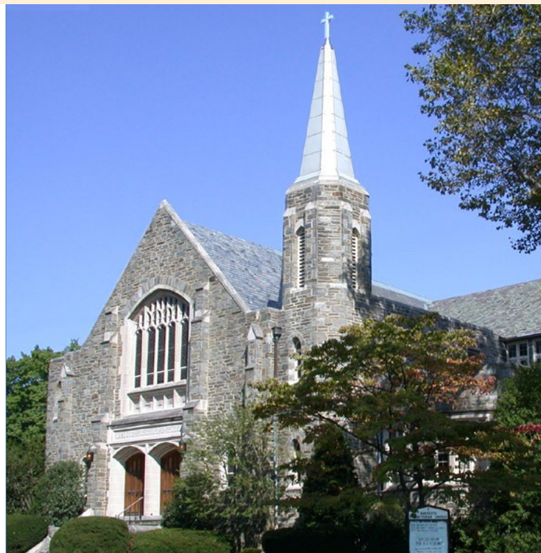
Exterior of Building