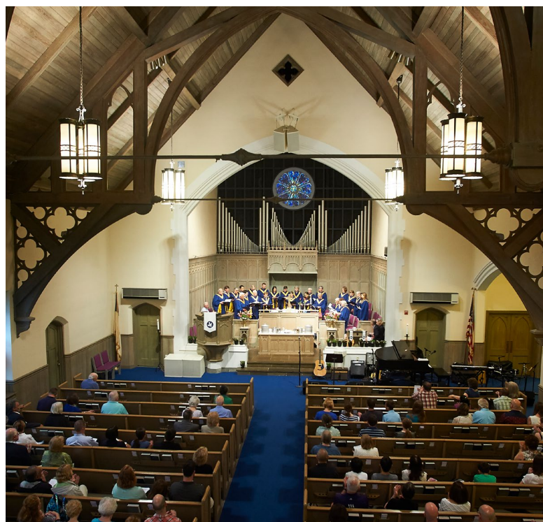
Interior of the Sanctuary