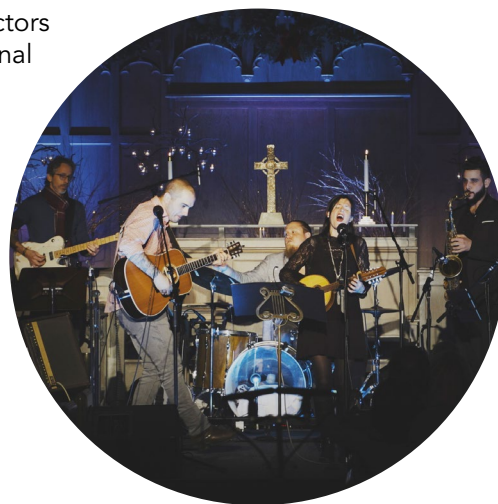
Benefit Christmas Concert

NPC's Hearts for Justice and Mercy Committee seeks to fulfill God's commission in Micah 6:8 to act justly and to love mercy and walk humbly with Him. To this end, we support members of our congregation who are already engaged in these ministries, inspire and disciple those seeking to find their niche, and encourage congregants to learn and pray for both the giver and recipients of our work. Areas of service include Quilts for Comfort, Philadelphia Service to the Homeless, Anti-Human Trafficking, Orphan Care, and Race Relations.