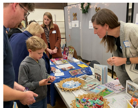
Gifts of Hope

Narberth Presbyterian Church has a serious commitment to missions. As a church, we contribute more than 20% of our overall budget to support career missionaries, members and friends on short-term mission trips, mission agencies actively sharing the Gospel, and ministries of care, justice and mercy. We have 37 mission causes found locally and around the world. This level of commitment is our response to "the Great Commission" of going into all the world to preach the Gospel. We raise awareness of missions through weekly bulletin updates and a yearly alternative gift market called Gifts of Hope which brings our entire congregation together along with representatives of dozens of our mission causes for education, support, and financial giving. Learn more about Gifts of Hope here .