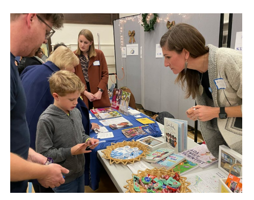
Gifts of Hope

Narberth Presbyterian Church has a serious commitment to missions. As a church, we contribute more than 20% of our overall budget to support career missionaries, members and friends on short-term mission trips, mission agencies actively sharing the Gospel, and ministries of care, justice and mercy. We have 37 mission causes found locally and around the world. This level of commitment is our response to "the Great Commission" of going into all the world to preach the Gospel. We raise awareness of missions through weekly bulletin updates and a yearly alternative gift market called Gifts of Hope which brings our entire congregation together along with representatives of dozens of our mission causes for education, support, and financial giving. Learn more about Gifts of Hope <u>here</u>.